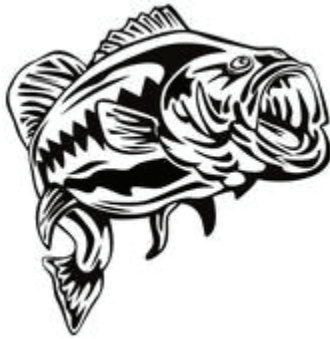
Large Mouth Bass

To find out about free or low-cost fishing lessons and fishing festivals or rodeos for kids, go to Georgia State Parks & Historic Site's Web site ( www.gastateparks.org ) and click on "Events."